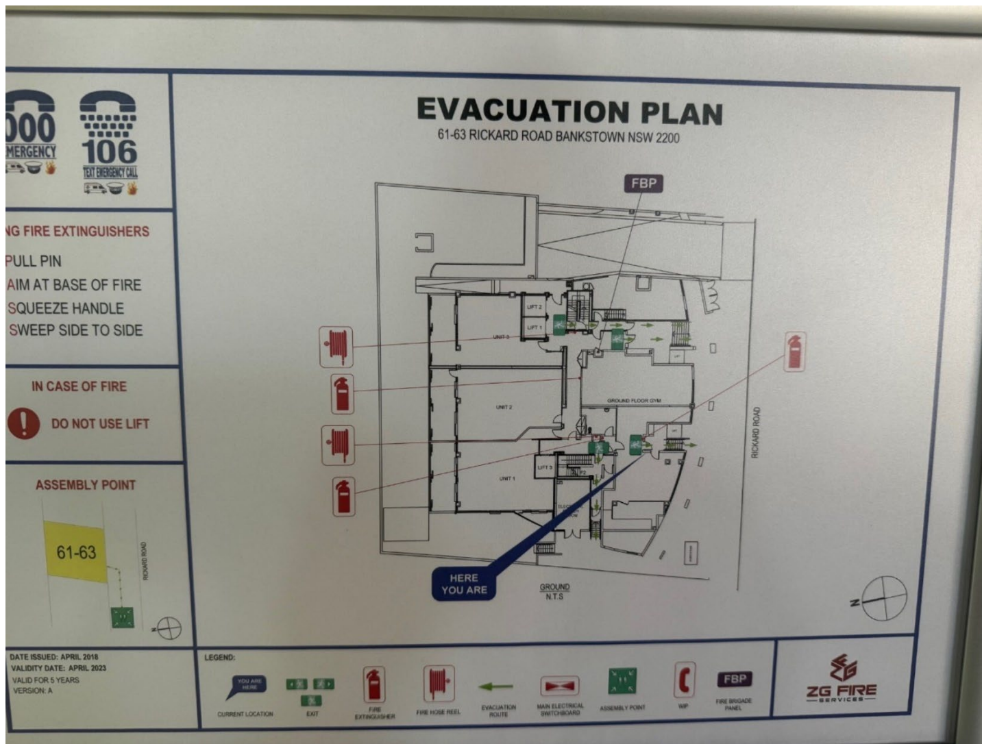
Figure 2 Evacuation Ground Plan with Existing Fire Measures